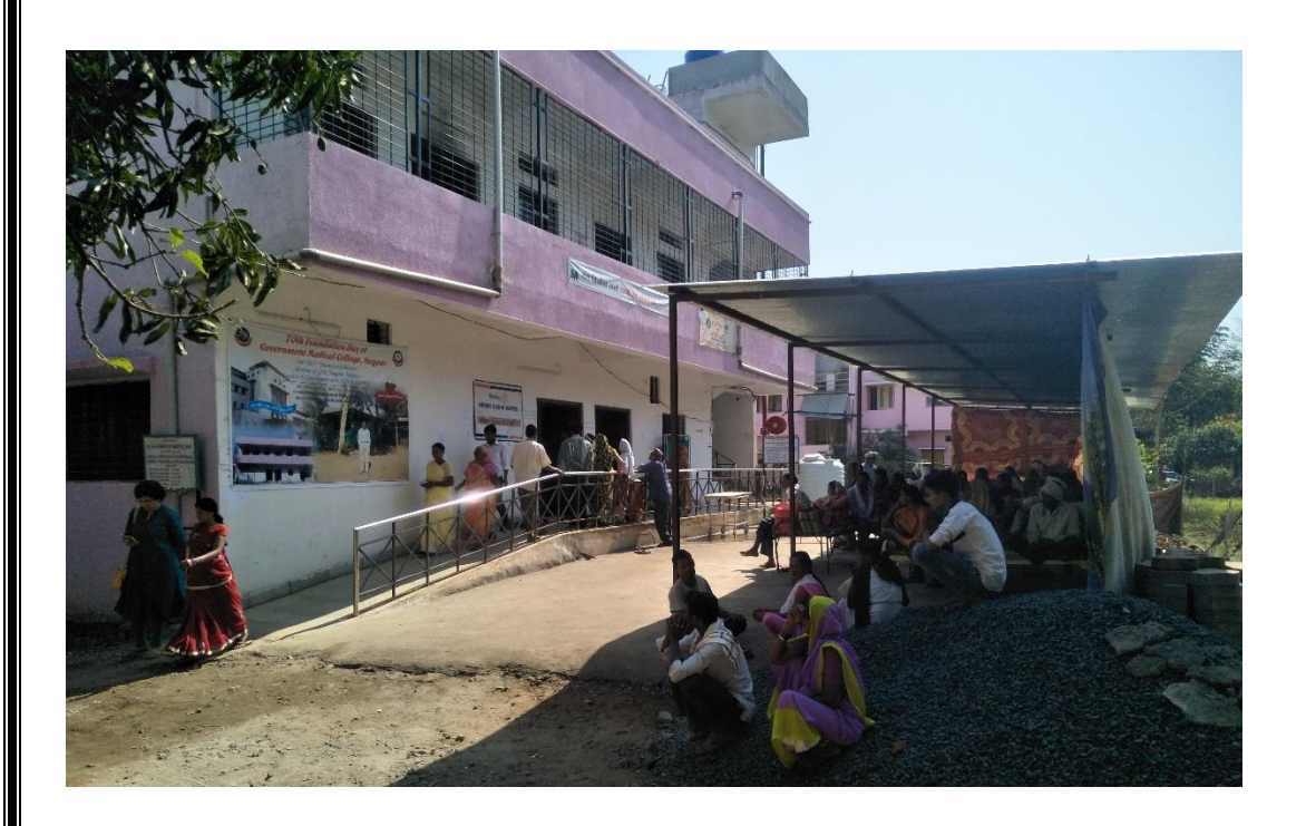
WAITING space for patients