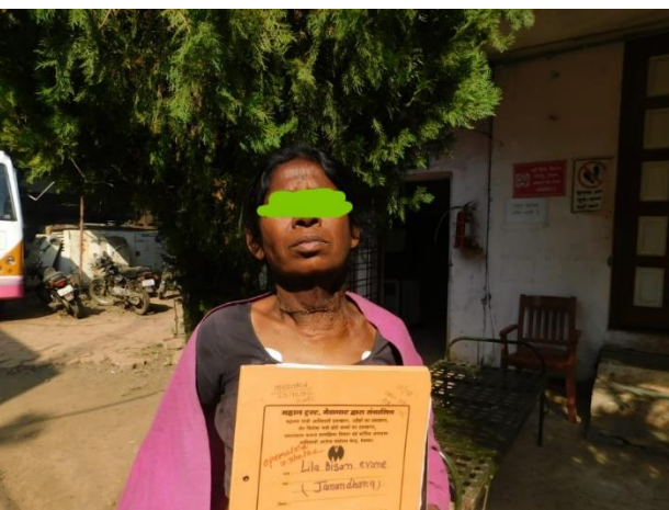
Figure 2 After surgery