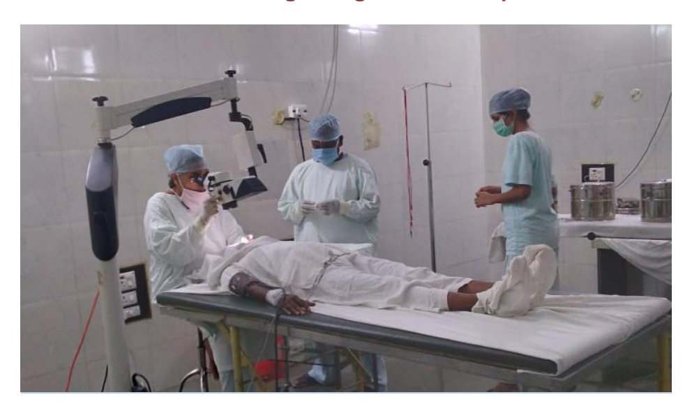
Ophthalmic surgeon performing Pterygium surgery