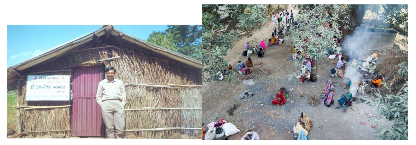
Figure: Hut hospital in beginning