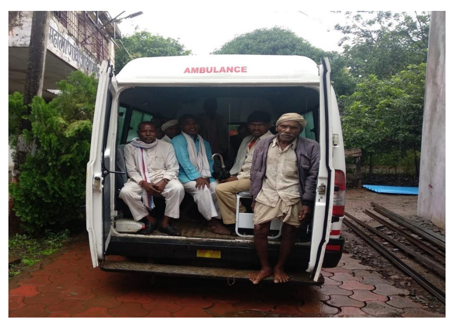
Patients being brought to the hospital