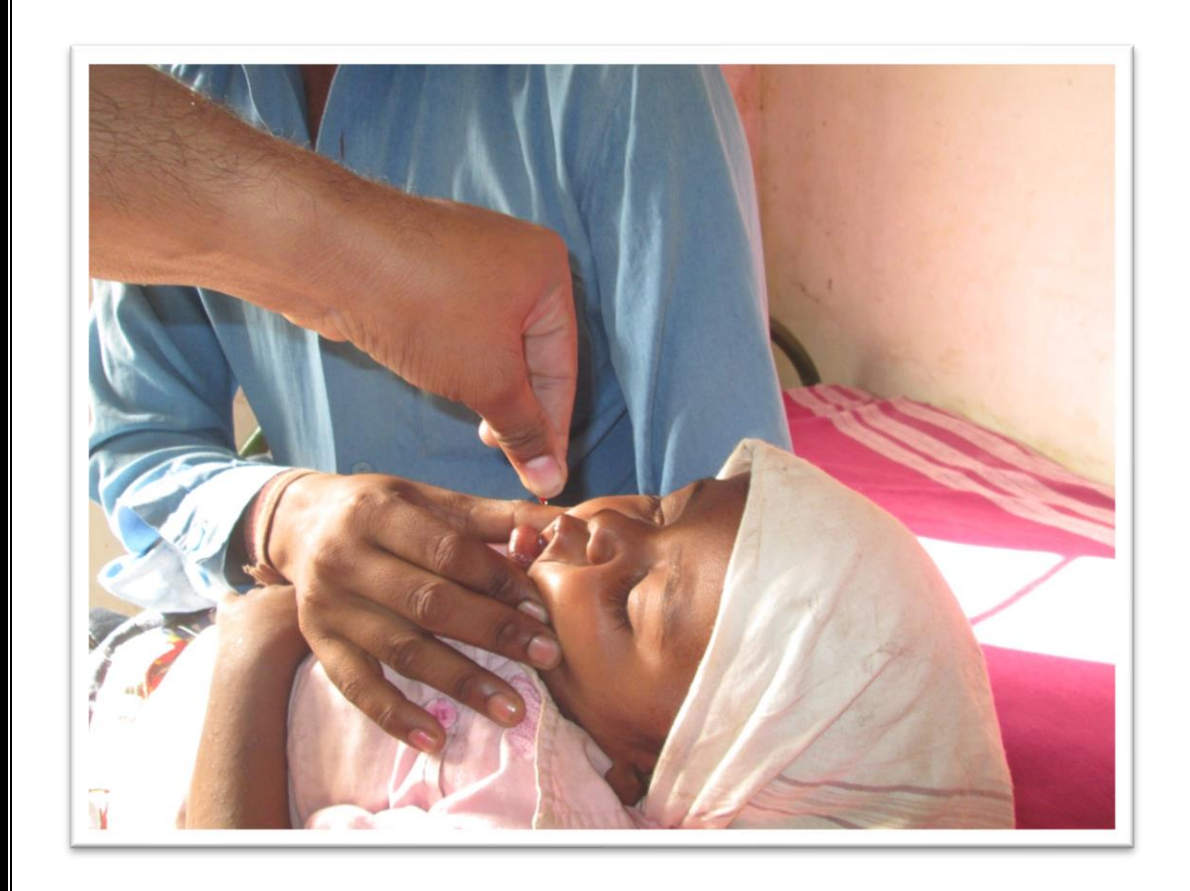
Figure 1 Vitamin A supplementation